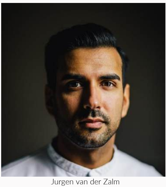
Executive Chef Restaurant Vinkeles